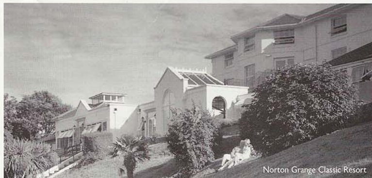
Norton Grange Classic Resort

ACOUSTIC BLUES & LATE NIGHT JAM SESSIONS